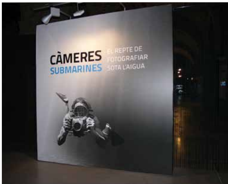
The entrance to the display area was graced with this very impressive photo of Hans Hass

Many unique pieces of historic underwater photo equipment were on display.