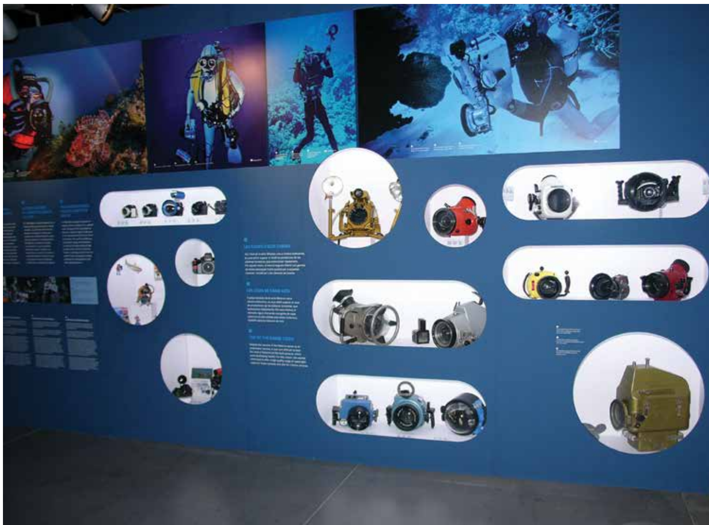
A stunning array of underwater cameras on display.