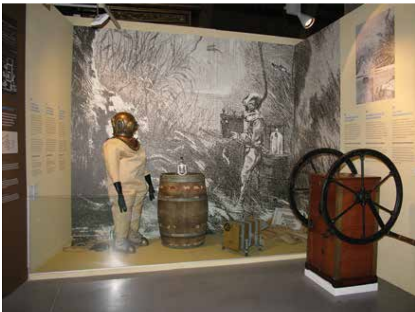
(Below) Louis Boutan diorama