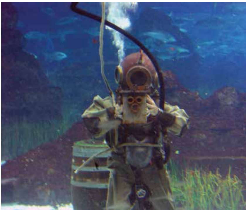
(Above) At the Barcelona Maritime Museum, a diver re-enacts Boutan's first attempts at underwater photography